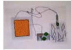
Colour image of bomb