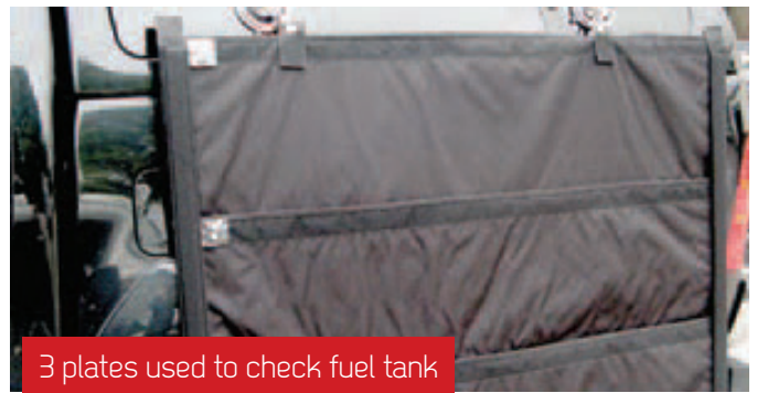
3 plates used to check fuel tank