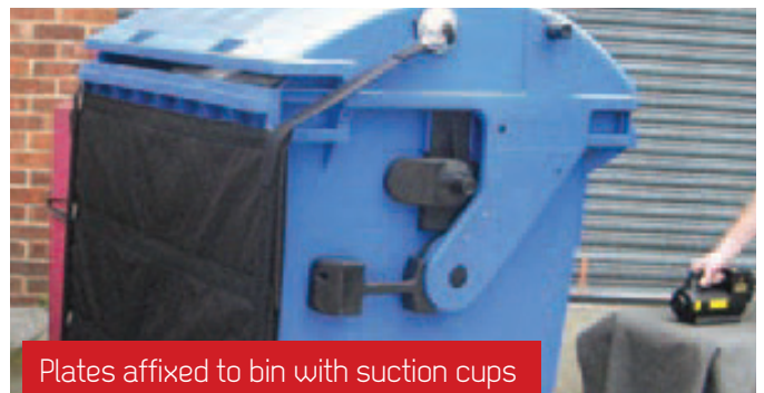
Plates affixed to bin with suction cups