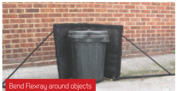
Bend Flexray around objects